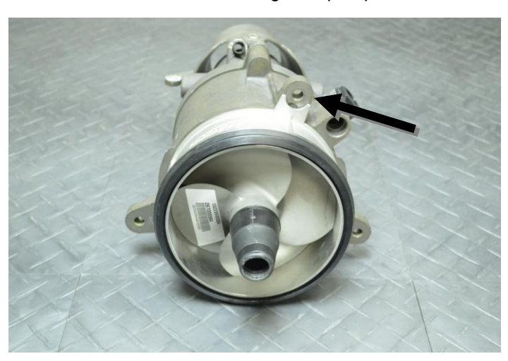
IMPORTANT: Note position of radiused tab on Stainless Steel Wear Ring.