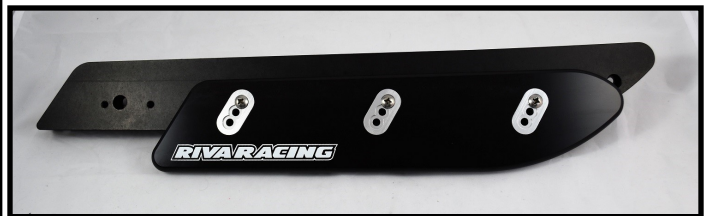
Sponson Fin In Full Forward Full Down Position

RIVA SX-R 1500 Sponsons are highly adjustable for different riding conditions and rider preferences.