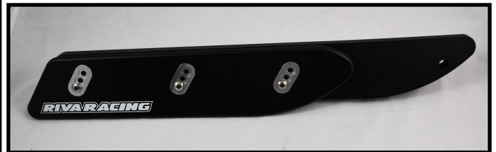
Sponson Fin In Full Back Full Up Position