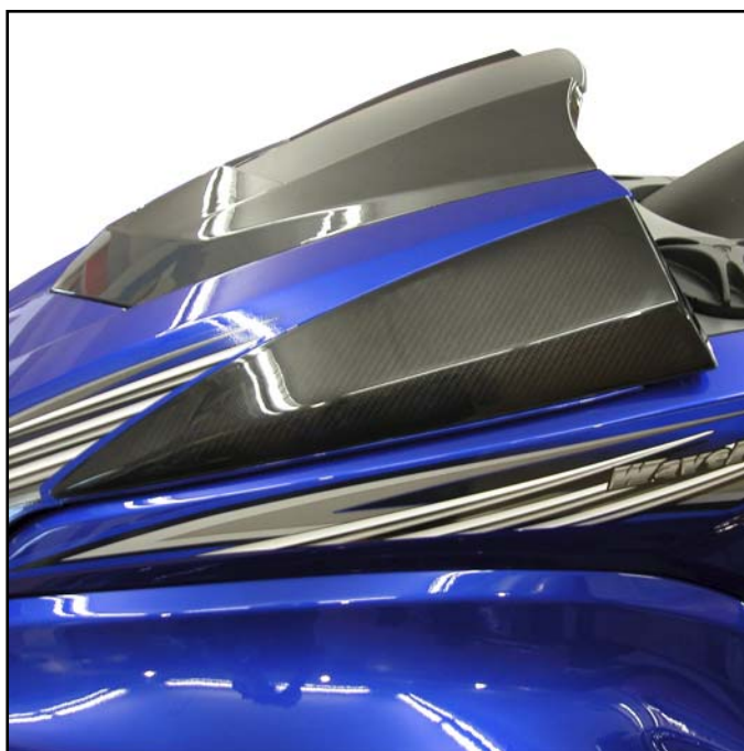
Illustration # 3